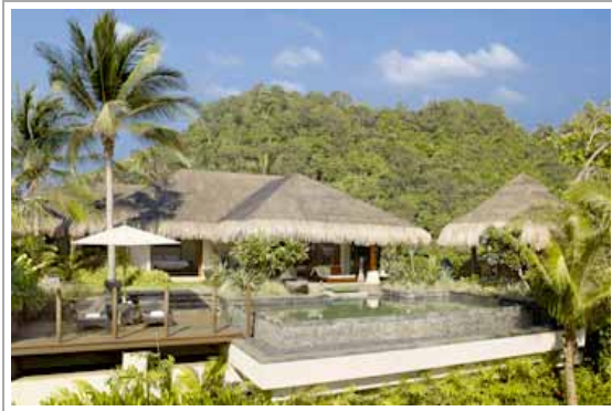
LAUNCH SLIDESHOW @Shangri-La Hotels and Resorts